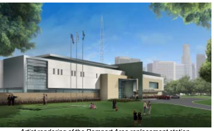
Artist rendering of the Rampart Area replacement station.